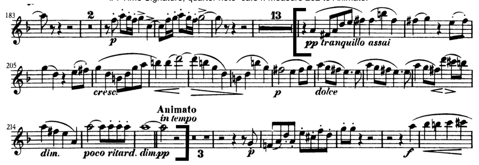
Excerpt D- Clarinet in B-flat

4/4 Time Signature, quarter note=ca.84. Measure 202 to Animato.